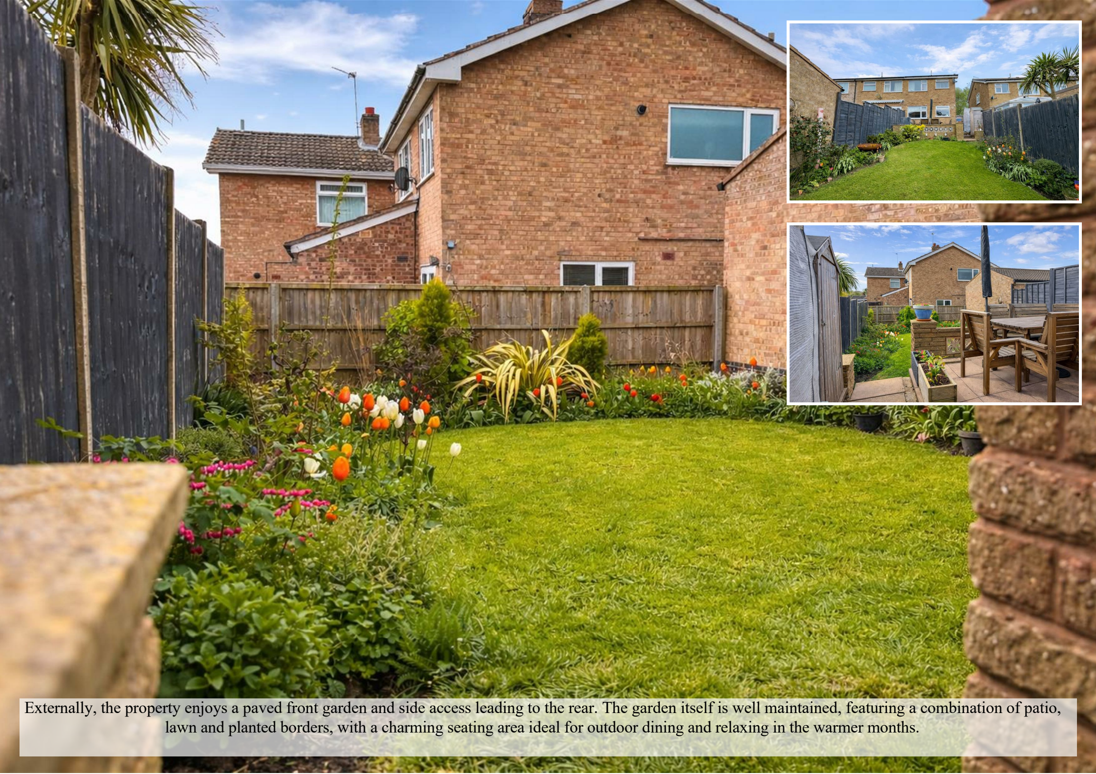
Externally, the property enjoys a paved front garden and side access leading to the rear. The garden itself is well maintained, featuring a combination of patio, lawn and planted borders, with a charming seating area ideal for outdoor dining and relaxing in the warmer months.